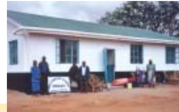
The Administration Block

Below: The 9 man team who completed the project in 9 months.