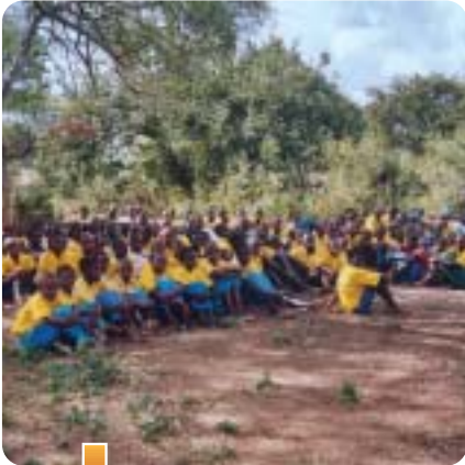
The girls class waiting