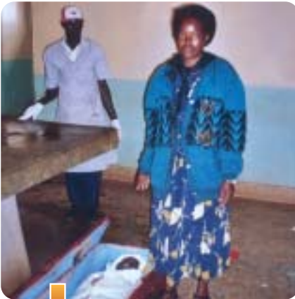
In the morgue

Do please remember in prayer our work in all it's parts. Do remember the plight of those for whom we serve. This is the third child this mother has lost.