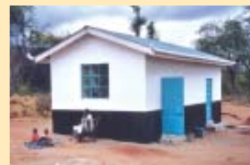
Kitchen & Store