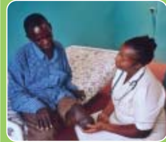
Above: This young man lost his leg due to a drunk driver, he was escorting a body from the mortuary with several others, when the driver of his vehicle lost control. We are presently enquiring about a prosthetic limb to enable him to again be the breadwinner for his family of seven children.

Perhaps you could pray for this specific incident that the forces of evil may be kept at bay and that the work may continue without fear or intimidation regarding the outcome of the trial.